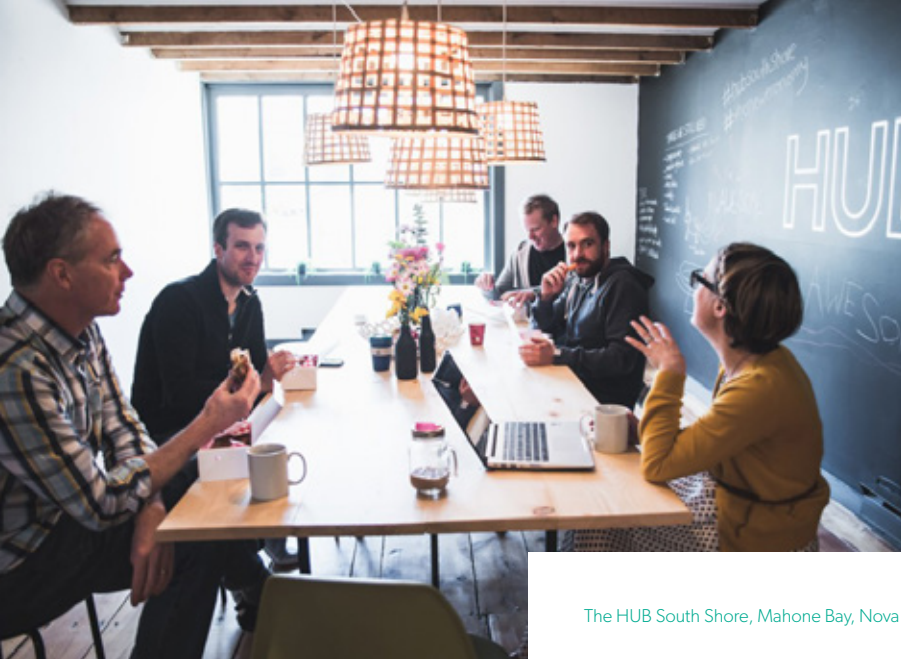
The HUB South Shore, Mahone Bay, Nova Scotia