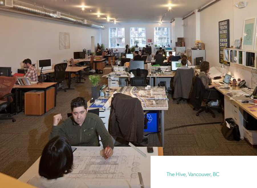
The Hive, Vancouver, BC

The analysis above identified some distinct challenges related to financing SPRE initiatives in all their phases. Financing is not separated out as a third pillar but rather, I believe a future learning community on SPRE should integrate financing as a necessary element of building proponent-level capacity and growing a more fertile environment for community infrastructure. Given existing networks of strong innovators and connectors in financing and investment across Canada, a pan-Canadian strategy for social purpose real estate should align itself to grow from and further build these networks.