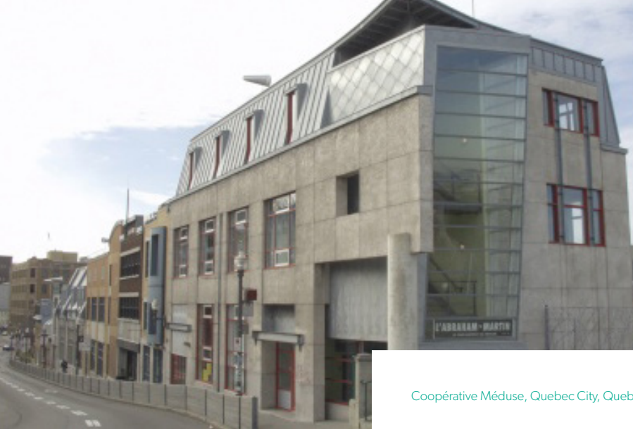
Coopérative Méduse, Quebec City, Quebec