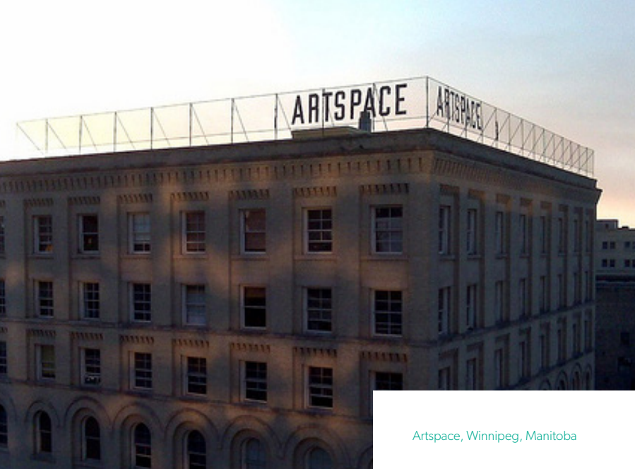
Artspace, Winnipeg, Manitoba

and the arts. Although the scan did not include interviews with these associations, the online review suggested some important considerations for formalizing a national learning community. It also revealed the struggles and adaptations that pan-Canadian networks have made to tackle funding cuts to their organizations or to the members, to create a bigger tent, and to add value to their members. A list is provided in Appendix C.