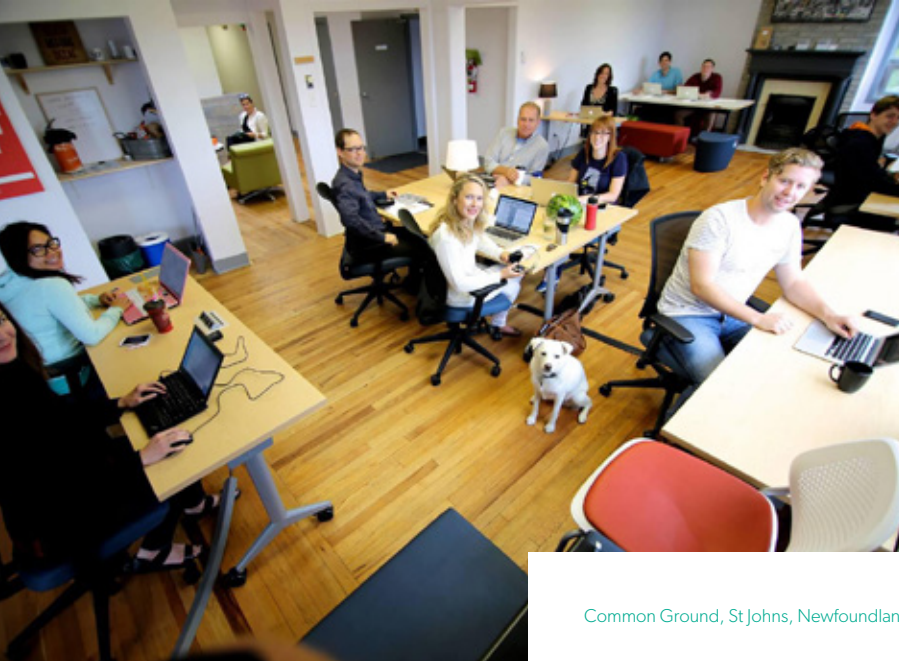
Common Ground, St Johns, Newfoundland