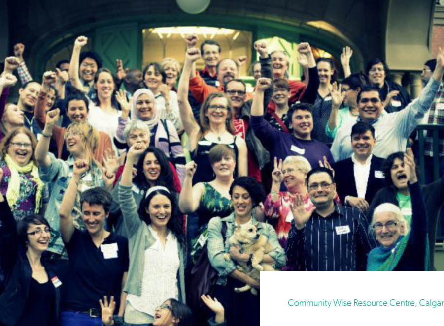
Community Wise Resource Centre, Calgary, Alberta

Underpinning the attention to shared value in the corporate sector is the bubbling sharing movement long sparked and nurtured by the nonprofit and social enterprise sectors. Shared platforms, shared services, shared spaces, and broadly, the sharing economy (with Airbnb as the most notable preacher) are now well rooted and growing exponentially. Tides Canada has been at the forefront of creating a shared services platform to create fertile ground for the emergence of grassroots initiatives, issues-based collaboratives and significant voluntary sector activities that do not need to be separate, standalone, incorporated charities. In Canada, as elsewhere, there is interest in structuring economies of scale that could improve and sustain charities, nonprofits, artists and social enterprises by eliminating the duplication of systems or services from back-office administration to client intake that could be more effectively shared. Models like the Saskatoon Community Service Village or the Kahanoff Centre Calgary, both over 10 years old, are well-established examples of investing in quality, shared office space as a foundation for stronger, more stable charitable organizations.