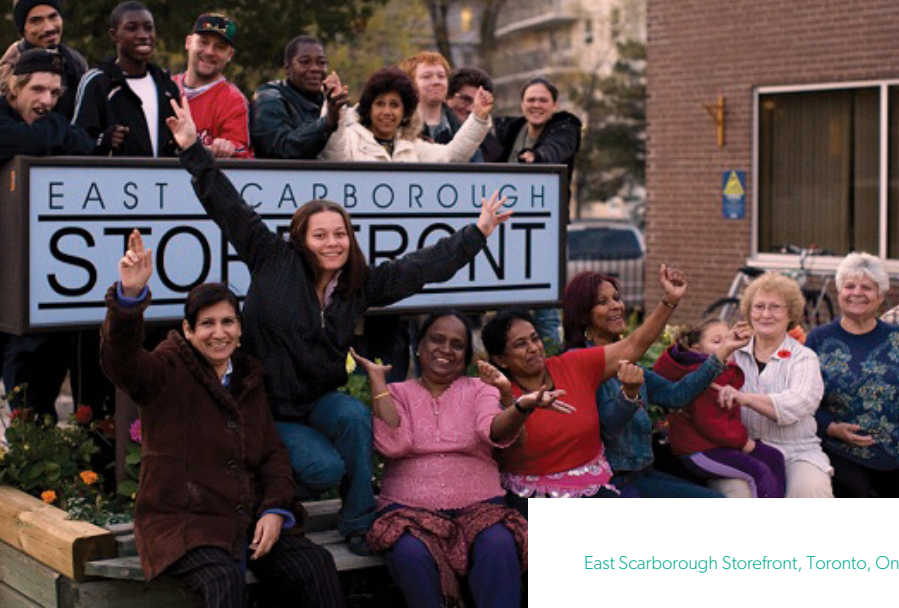
East Scarborough Storefront, Toronto, Ontario

There is not a rigid line between these capacity areas: individual capacity and shared space success or failure influence financial and policy-enabling environments and vice-versa. In addition, while these insights and ideas were generated through a look specifically at shared space initiatives, some opportunities and strategies can be extended more expansively to social purpose real estate in general. What follows is an overview of common themes and challenges as well as strategies grouped by issue. The strategies represent ideas generated from the outreach; they range from quick wins to system change; their inclusion here does not confirm that they are the right priorities, the only approach, or are feasible to undertake for a national learning community. To convey a bit of the spirit of the conversations, headings in italics are quotes or metaphors I heard during the scan.