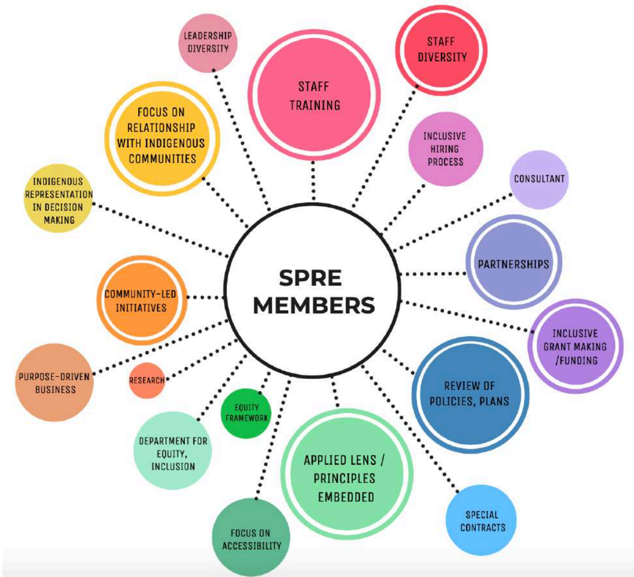
Figure 2 – Mind map of initiatives mentioned by SPRE members during interviews.

The following mind map illustrates the range of categories of initiatives being explored by SPRE members. The size of circles is an approximate representation of the frequency to which initiatives were mentioned during interviews.